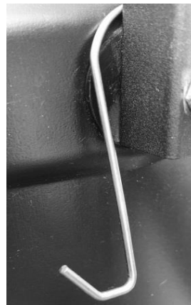
Hook stowed on side of barrel